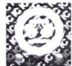
DENNIS B. FUNA Insurance Commissioner

For the information and guidance of the general public.